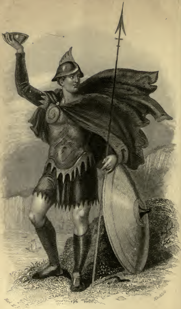
An Anglo-Saxon Chief.